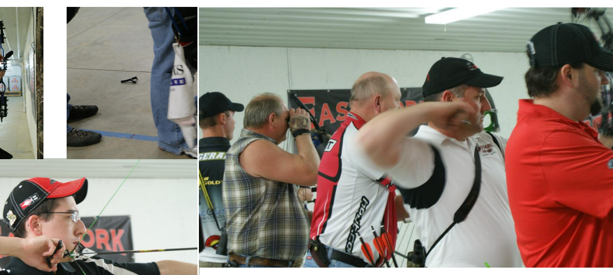
Above: NFAA Indoor Championship Shooters