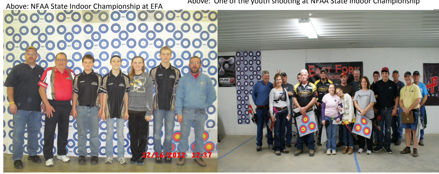
Butch's Smokey Hollow (NFAA State Indoor Championship)