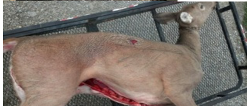
Above: Doe