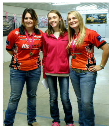
2013 Cassie's SHOOT FOR GIRLS At East Fork Archery Breast Cancer Awareness