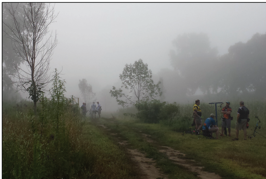
Morning fog as archers wait for the horn to begin their day of shooting at the 2014 NFAA National Outdoor Field Championship in Yankton, SD. The tournament ran Wednesday through Sunday, July 30 - Aug. 3. Missouri Bow Hunters was well represented at this year's tournament.