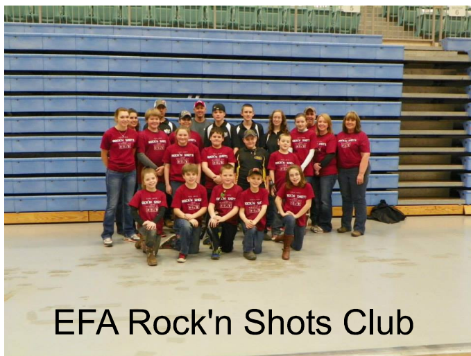
EFA Rock'n Shots Club

For many, this was their first ever archery competition. Congrats to all that participated... Great job!!!