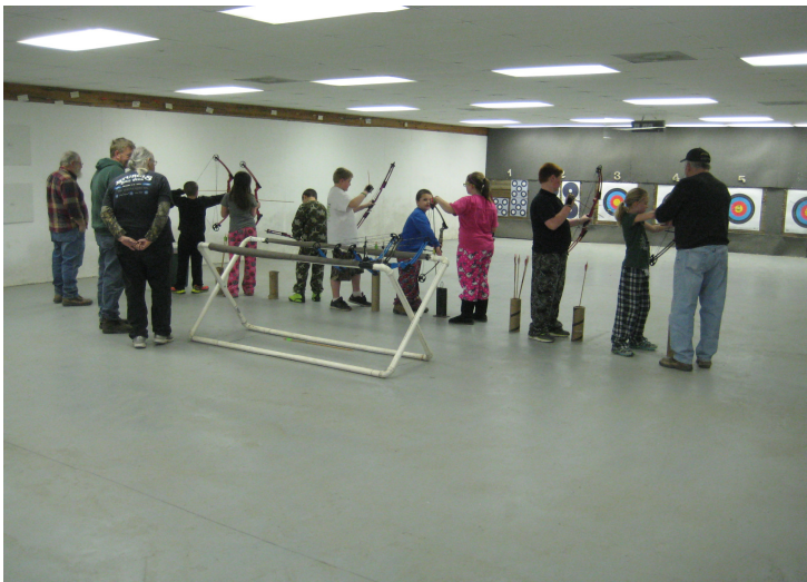
Pictured above: Students participating in NASP lessons at Nodaho Bow Hunters.