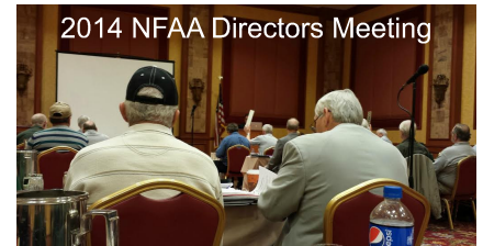
2014 NFAA Directors Meeting