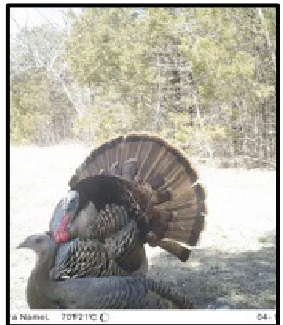
Jeff Blystone's Trailcam ▶ "the one that got away"