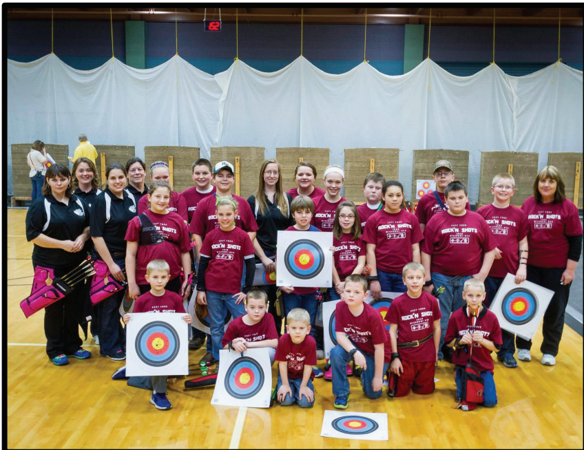
2014 MBH State Indoor Championship

The East Fork Rock'n Shots JOAD Outdoor Program has just begun and continue through early August. Information about the program can be obtained by calling the ProShop at (660) 277-3291.