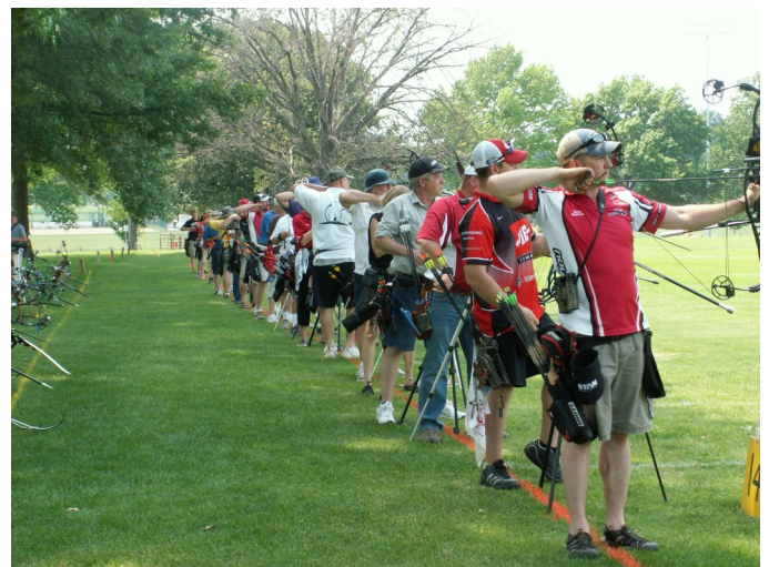
Shooters at Forest Park, St. Louis, MO 2012

Conservation Report Calendar of Events Club Directory Membership Application 3D Shoot Etiquette MBH 600 Entry