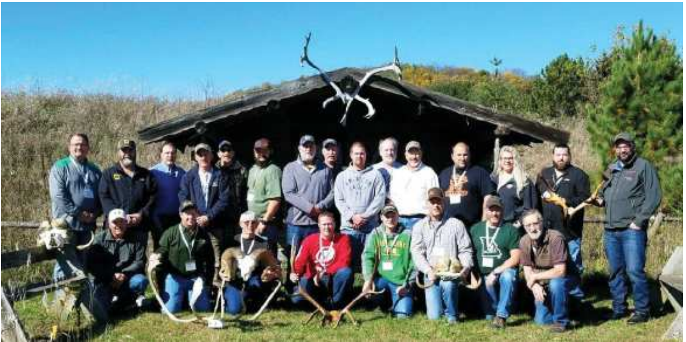
Measurers Workshop 10/13-17/2017