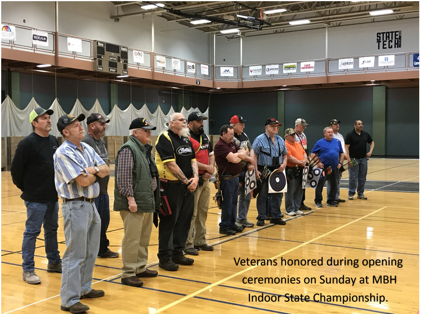
Veterans honored during opening ceremonies on Sunday at MBH Indoor State Championship.