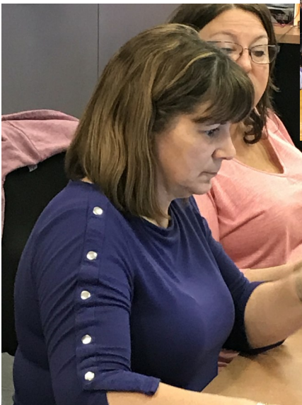
Volunteers make it all happen at the tournament.