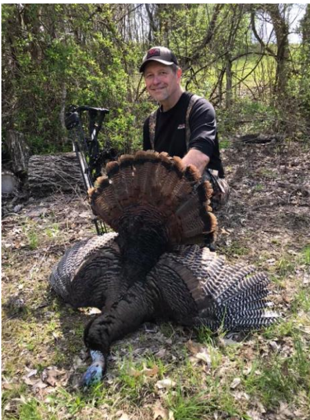
2019 Missouri Eastern