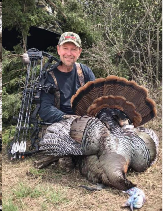
2019 Kansas Rio Grande