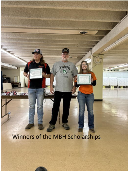
Winners of the MBH Scholarships